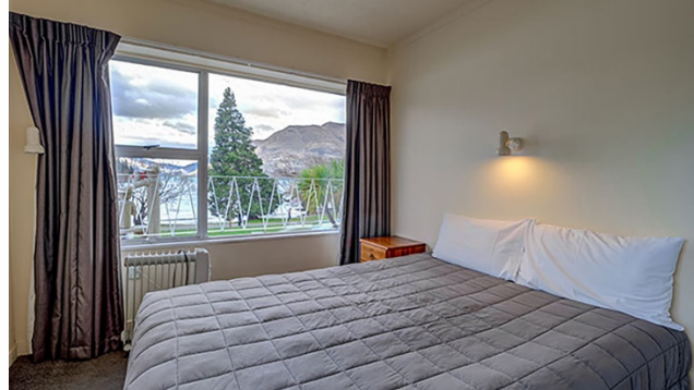
LAKESIDE MOTEL 18 Lake Esplanade, Queenstown 9300

The Lakeside Motel is one of the most popular motels in Queenstown due to its proximity to the lake, scenic views, and adventure sports. Lakeside Motel is your answer if you're looking for a studio or family accommodation in Queenstown. All our rooms have been designed with your comfort in mind and are warm, welcoming, and affordable. Wake up to the stunning mountain views over Lake Wakatipu without the expensive price tag!