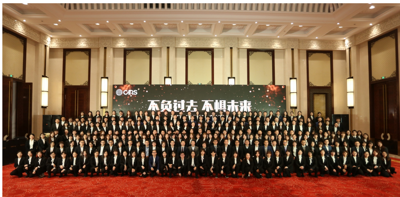
CIRS GROUP / 瑞旭集团

In addition, C&K Testing, a wholly owned subsidiary of CIRS, can provide regulatory testing of chemical, cosmetic, consumer goods, food contact materials and environment. It has built a lab management system in according with ISO/IEC 17025 and qualification assessment criteria for inspection and testing institutions, and has been in effective operation. C&K Testing has been accredited by China National Accreditation Service for Conformity Assessment (CNAS) and China Metrology Accreditation (CMA). It is also a member of Joint Article Management Promotion-consortium (JAMP), and has been recognised by the US Consumer Product Safety Commission (CPSC) as a third-party testing lab in China.