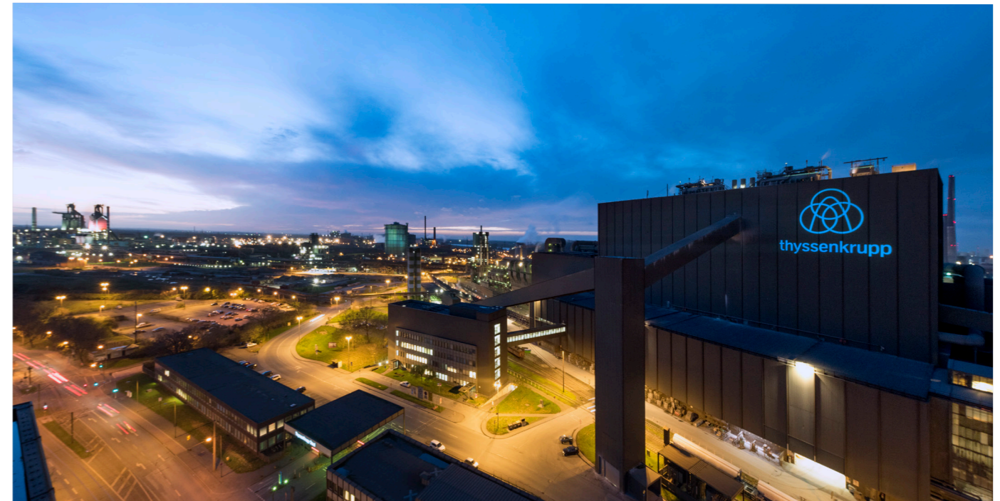
thyssenkrupp Steel Europe, Duisburg

“The interface between our upstream operations and hot strip production is a core element of our integrated production network. We are now making this area fit for the next generation. By separating and rebuilding the casting and rolling sections, we can further enhance our capabilities for high-strength steels and premium finishes. By splitting off the rolling section into a separate hot strip mill, we will also make our slab production more flexible.”