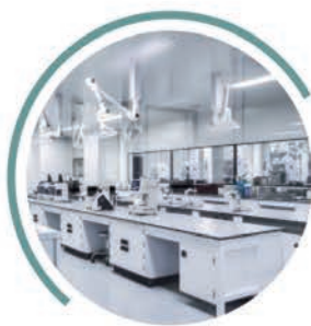
实验室设计及装修